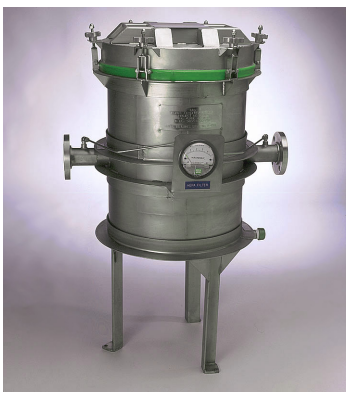
Leg option available for free-standing applications.

Testing ports are available for overall efficiency evaluation of the filter. A challenge injection port is installed on the inlet. The challenge is dispersed by an air baffle plate for complete mixing. The sampling port is on the outlet flange connection.